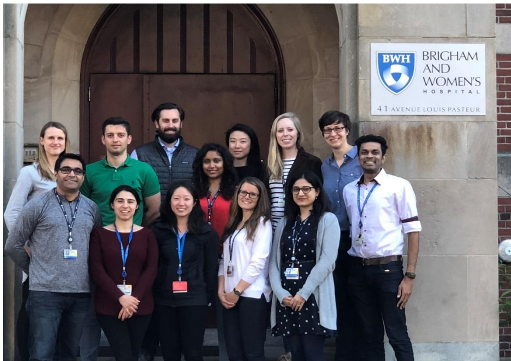
BRIGHAM AND WOMEN'S HOSPITAL POSTDOCTORAL ASSOCIATION